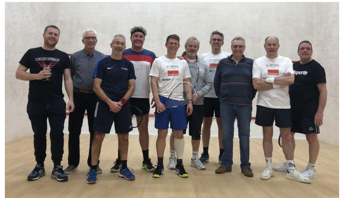
Stillington and Wigginton racketball teams at a pre-season friendly match