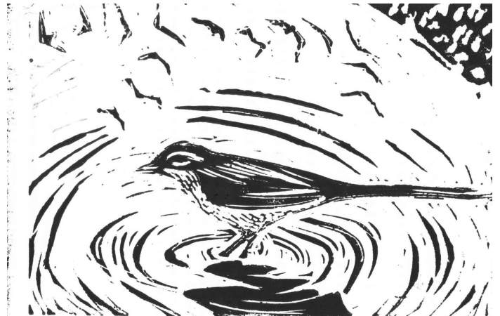
An original lino print by Emma Johnson

Ofsted Unique Reference Number: EY308489